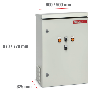
ACV30-PV Outdoor mounting