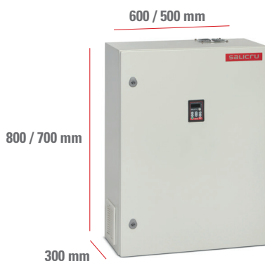
ACV30-PV Indoor mounting