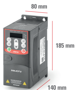
CV30-015/022-S2 PV CV30-008-022-4 PV