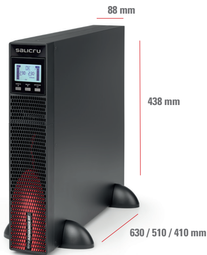
SPS 800-3000 ADV RT2