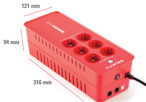
SPS 650/850 HOME