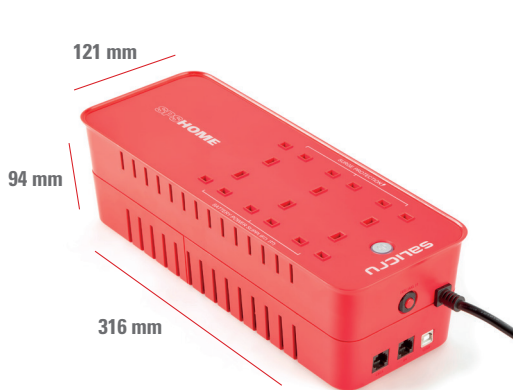
SPS 650/850 HOME UK